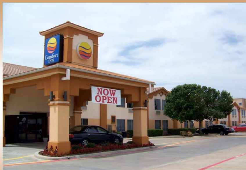
Comfort Inn at 3232 SE Loop 820 is now back open and ready for business after being closed for several months due to a fire.

For more information, call the City Secretary's office at 817-568-3040.