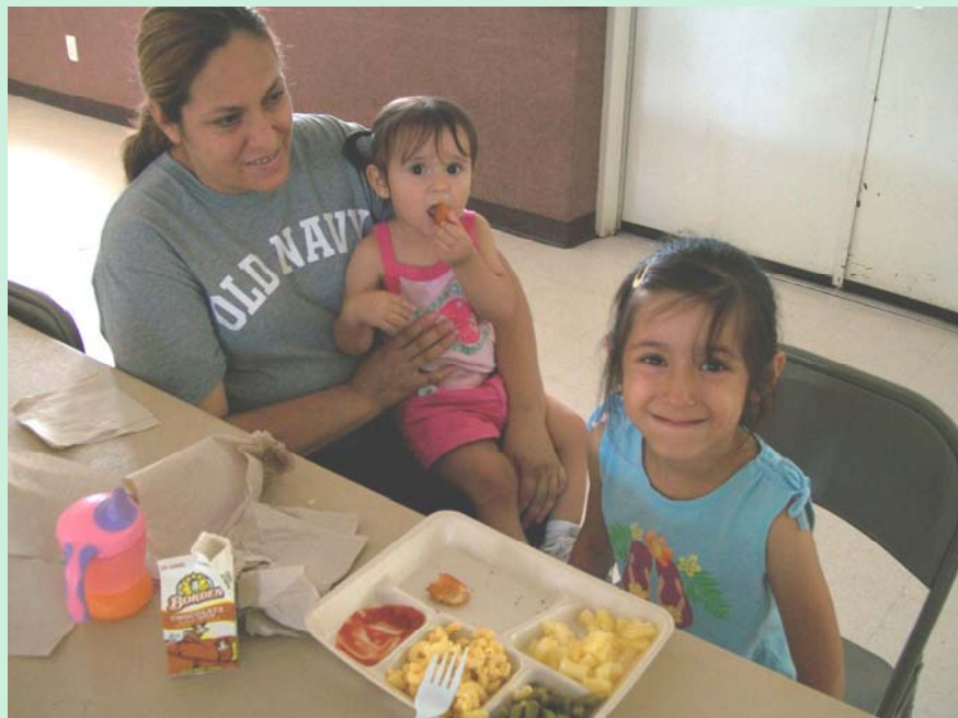
Forest Hill children enjoy a hot meal at the free summer lunch program going on weekdays through August 20th at the Community Center, Griggs Park and Emily Trentman Park. For details, call 817-568-3003.