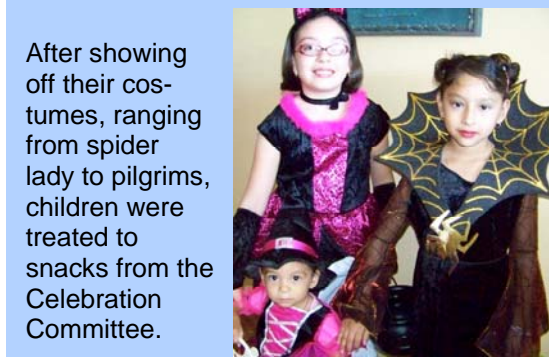
After showing off their costumes, ranging from spider lady to pilgrims, children were treated to snacks from the Celebration Committee.