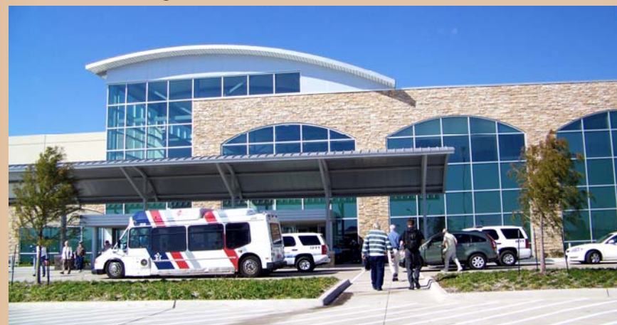
Veterans flock to center for open house.

Local veterans got a sneak peek at the new North Texas Vet Center on Wednesday, November 10, prior to its opening on the next Monday. The new clinic boasts 239,000 square feet, almost five times larger than the old one. It will provide more resources, access and services to the more than 150,000 veterans in Tarrant, Johnson, Hood, Wise and Parker counties. And... best of all, it is in Forest Hill's front yard!