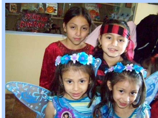
A lot of trick-or-treaters, including these fairy twins, showed up at the City's Halloween festivities, held at the Library.