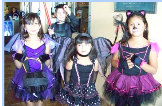
Youngsters said purple and black were the most popular colors for costumes this year.