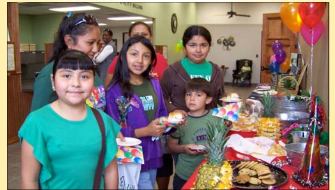
Visitors to City Hall received commemorative t-shirts and other goodies along with birthday cake.