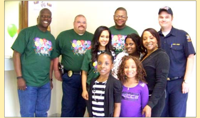
Tours of the new Police/Fire Substation were a hit.