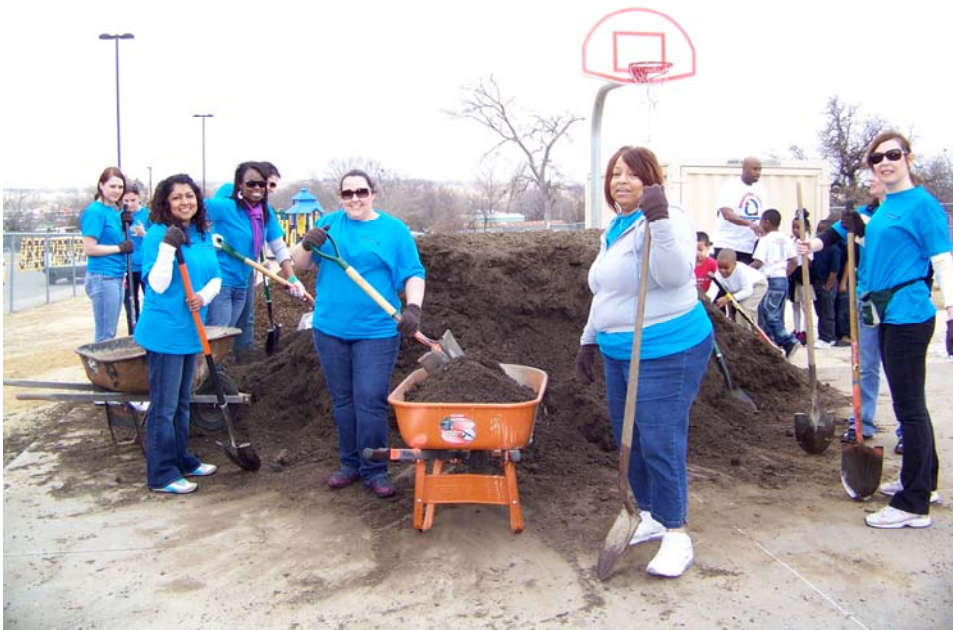
Volunteers move dirt during REAL garden project.

Volunteers from the Forest Hill Lions Club, Mercedes Financial and parents and volunteers