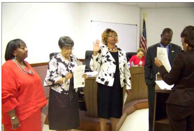
Incumbents take Oath of Office

Voters returned two incumbents to City Council seats on Saturday, May 8. Election results included: