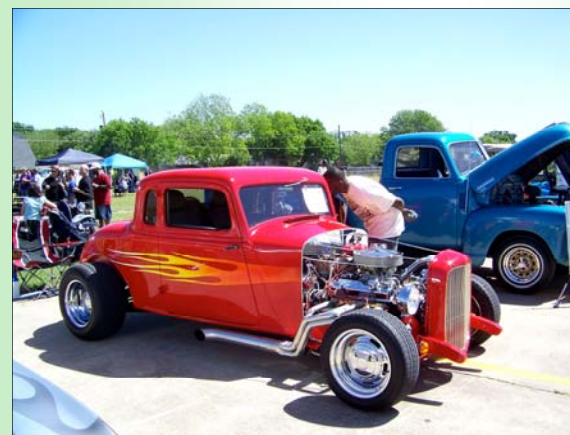
One of many classic cars entered in the Forest Hill Lions Club car show which was part of a daylong series of events.

Visit us on the web @ www.foresthilltx.org