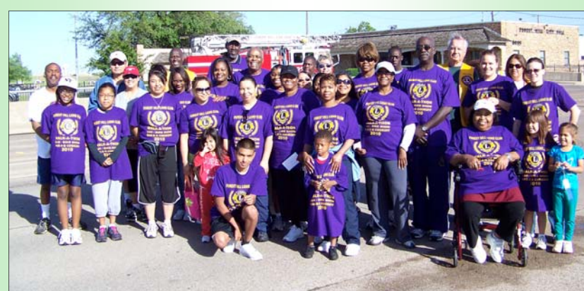
Walkers line up on Forest Hill Drive escorted by Forest Hill police officers.

For more information about ONCOR's Smart Meter program, log onto www.smarttexas.com .