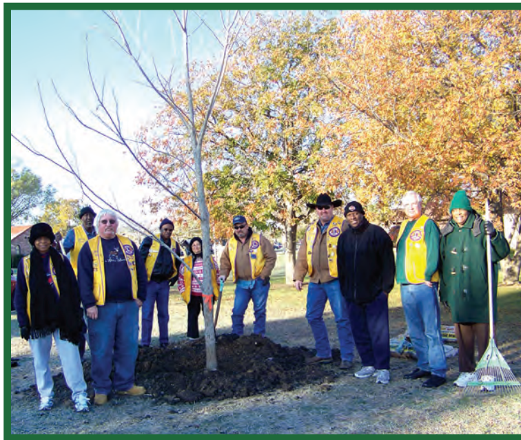
Forest Hill Lions braved the winter chill to plant a native persimmon tree in Heritage Park as part of an International Lions commemoration.