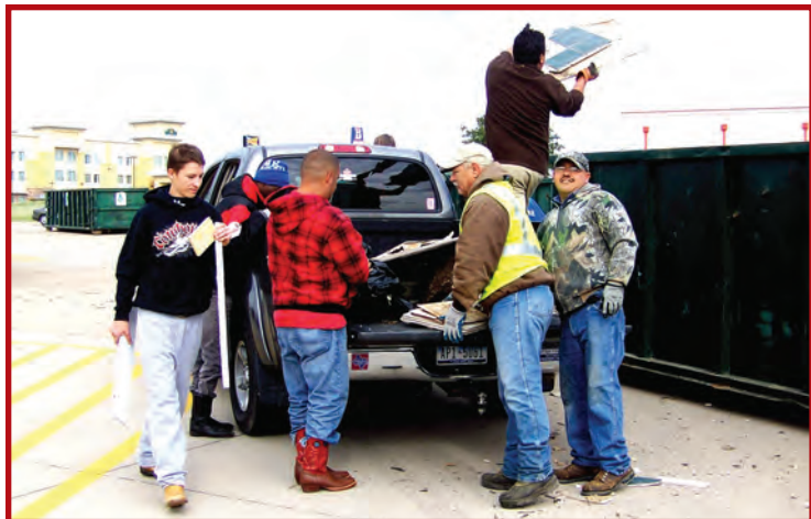
Volunteers and city employees pitched in to help during the semi-annual Clean-up Day held November 12 at Super 1. City officials issued a big “thank you” to all who helped.